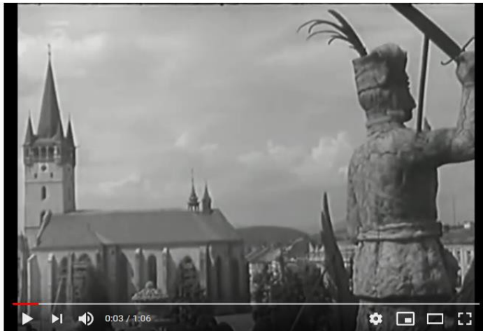
1. Prešov - Rákócziho dom (1956)

1 TASK 1 - Define a type of historical source and write it down.